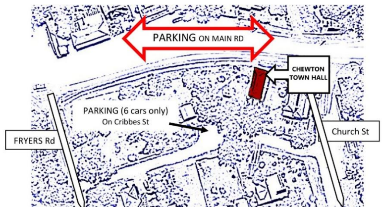
Chewton Town Hall – Location Map

Financial members get full benefits from the club, where members get a regular email updating events, talks, and any changes to the year's programme.